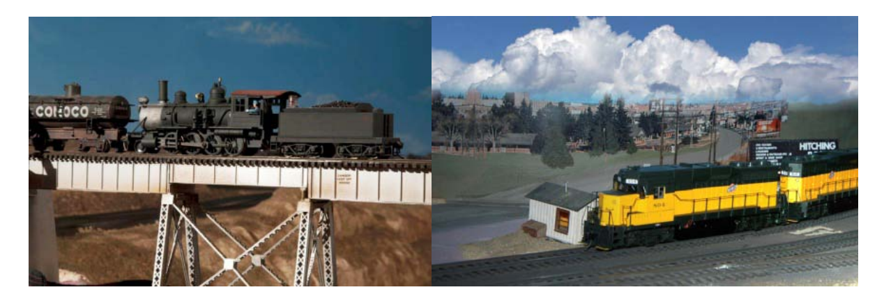
Visiting Wisconsin equipment enjoys the bridges and backgrounds on this layout.

The large staging and yard facilities have allowed operations of "History Passing on the Rails", a parade of trains from early steam, through the Big Boy era into the most modern equipment. This operation is a favorite of guests at the French's house during the holidays.